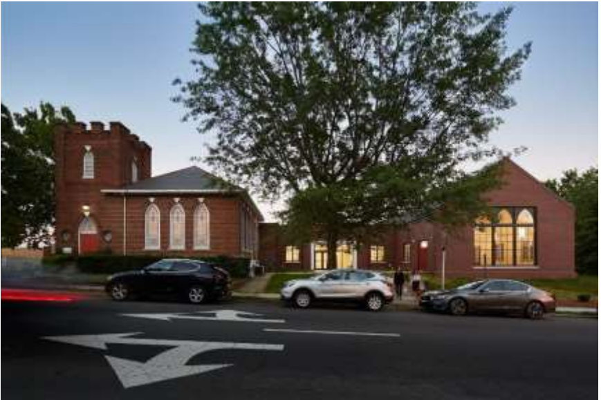
Davie Street Presbyterian Church